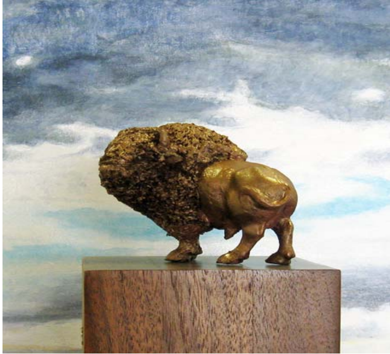
Bison: "Black Dog II"