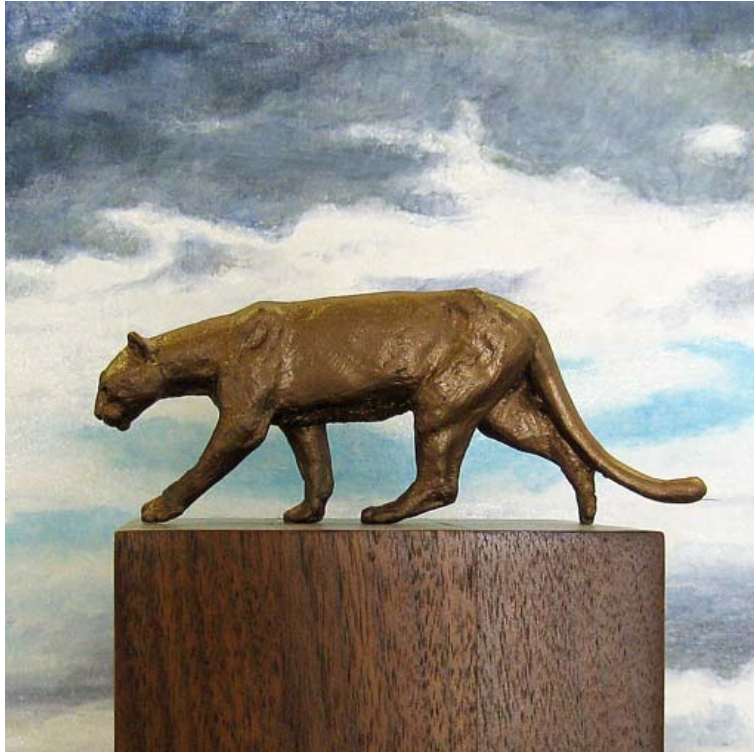
Cougar: "Catamount II"